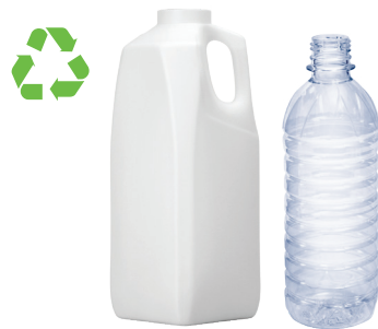
PLASTIC Bottles & Jugs 1, 2 & 5