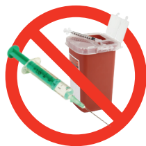
NO Medical Waste