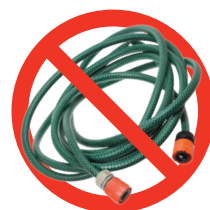
NO Garden Hoses