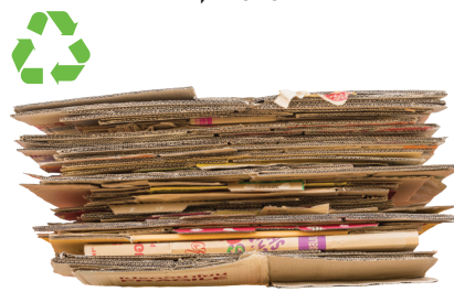
CARDBOARD Dry & Flattened No Food Contact