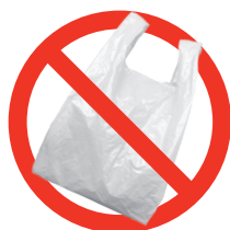
NO Plastic Bags