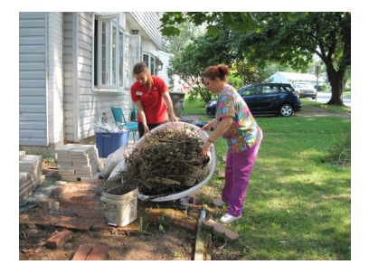
Getting people to be responsible.